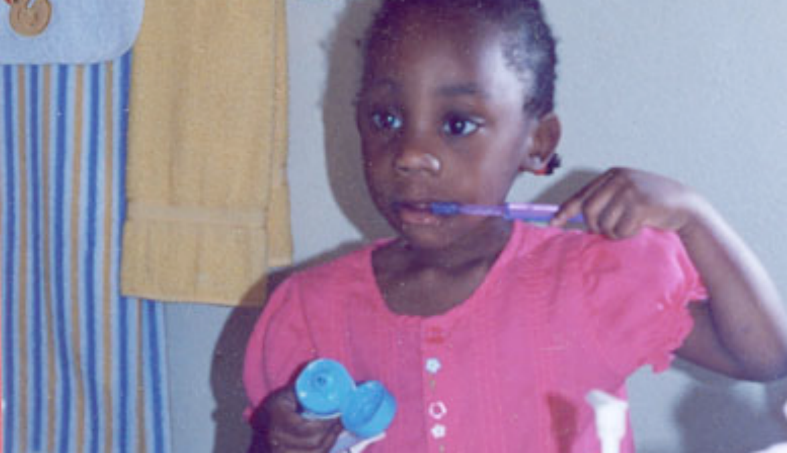
She brushes her teeth.