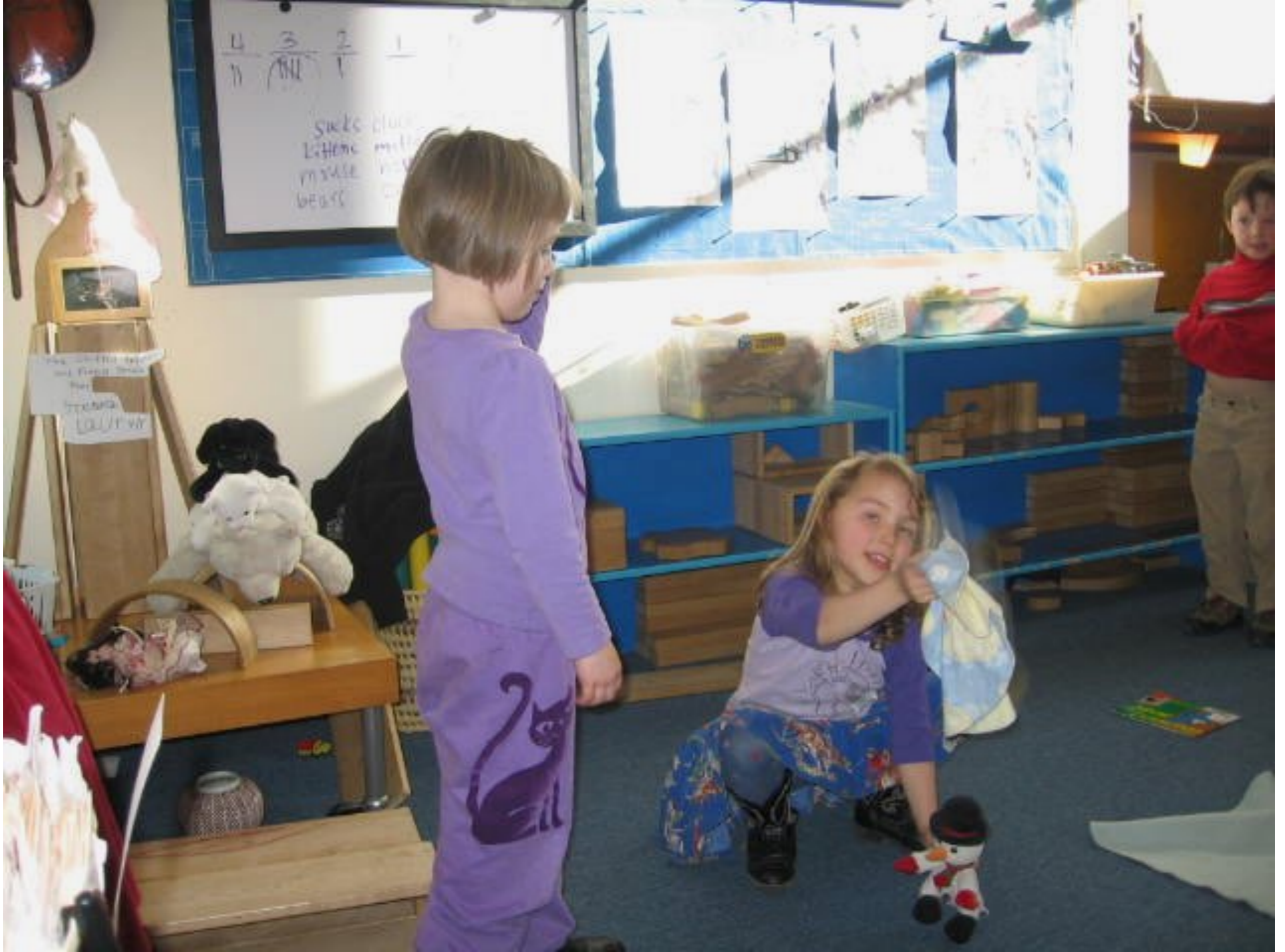
The stuffed animals and people Play