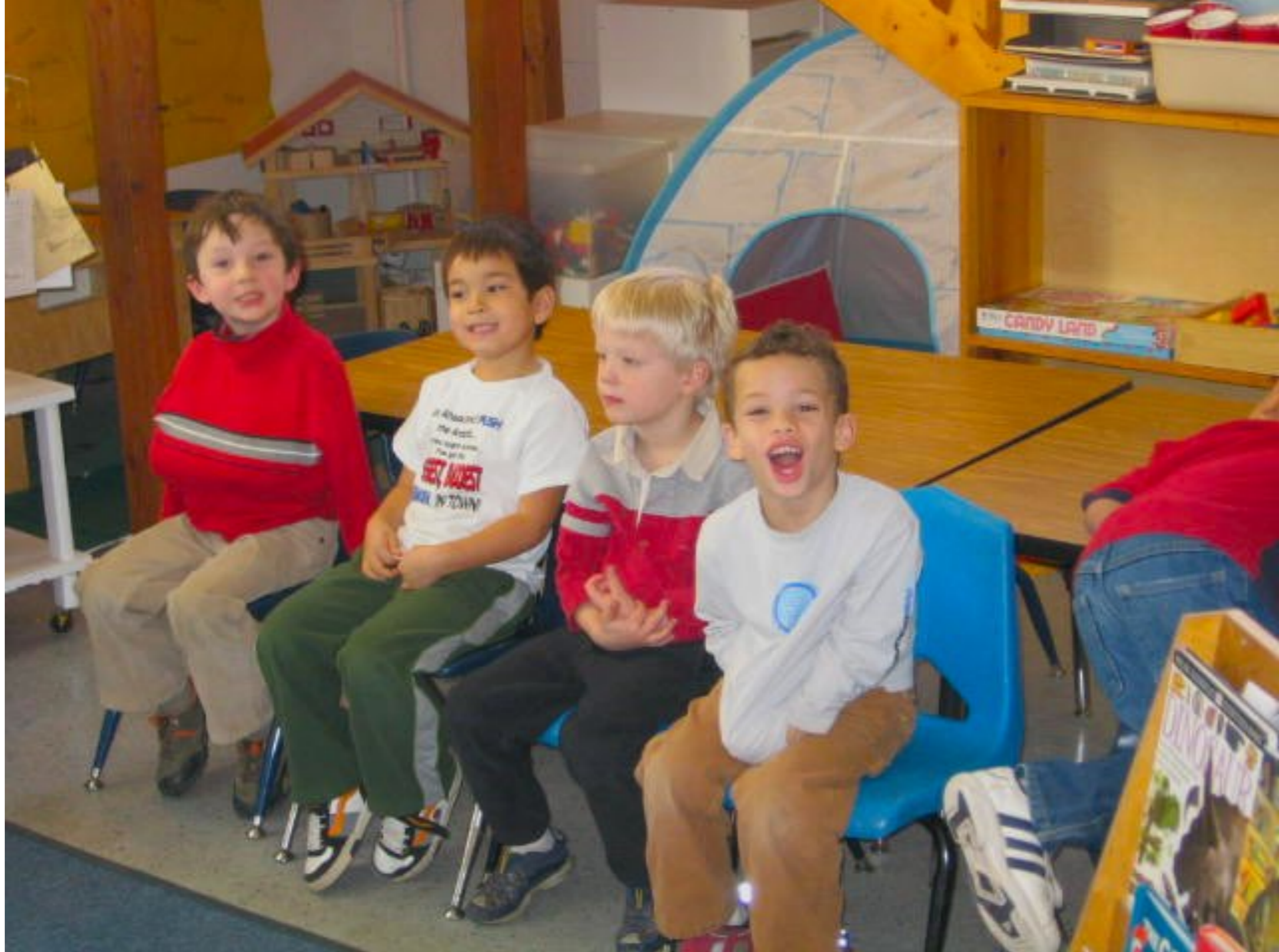
The audience gathered for the production.